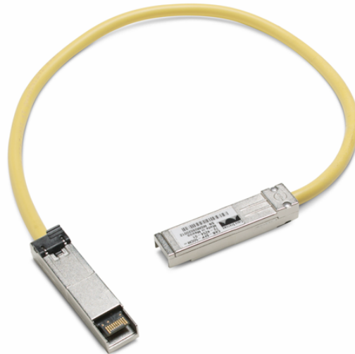
Figure 2. Cisco Catalyst 3560 SFP Interconnect Cable

Table 1 gives the features and benefits of the Cisco Catalyst 3560 Series. Table 2 gives the hardware specifications, and Table 3 gives the power specifications. Table 4 lists the management and standards support, and Table 5 provides the safety and compliance information.