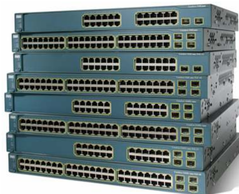
Figure 1. Cisco Catalyst 3560 Switches