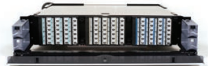
SYSTIMAX 360 iPatch G2 High Density Fiber Shelf