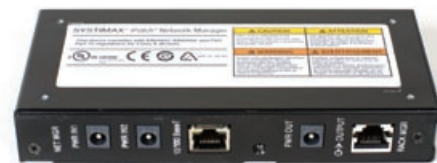
SYSTIMAX 360 iPatch Network Manager

With the iPatch Control System operating as a reporting system for your Intelligent Infrastructure Solutions, you gain the Vision and Knowledge you need to take Control of your network.